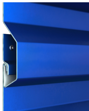
Assembly Detail Without Clip